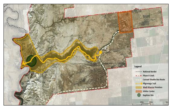
Figure (1) Shows Wadi Al-Kharrar