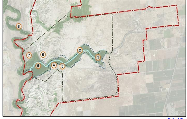
Figure (2) Shows archaeological Features of the Site (After: Waheeb, 1998 [14])