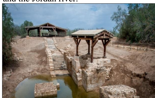
Figure (4) Shows the small church with its staircase leading down to the water of Jordan River

A visit to the baptism site gives the chance to see the place where many religious events that are mentioned in the New Testament happened. In addition to that it enables the visitors to see churches, water installations, baptismal pools, cisterns, colored mosaic floors, stone piles and caves in one site. Moreover, baptism at the site can be held. It is also interesting to add that Christians baptize in the Jordan River since a long time until now, fig. (4). Visitor circulation starts from the visitor centre to the Jordan River and so includes visiting Tall Al-Kharrar, Wadi Al-Kharrar, the Pilgrims station, John the Baptist spring, the Byzantine structural complex, caves, John the Baptist church, site of Saint Mary of Egypt and the Jordan river.