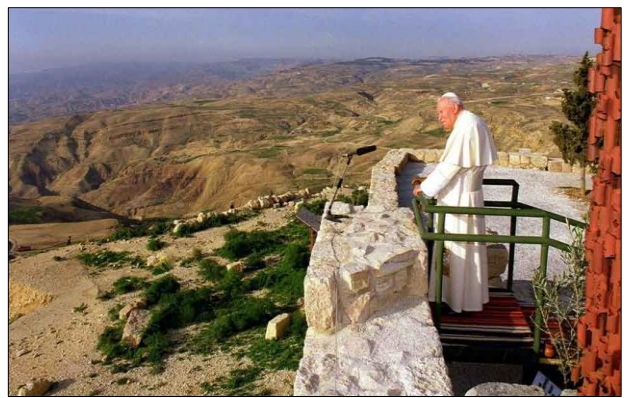
Figure (3) Shows pope John Paul II overlooking Mount Nebo